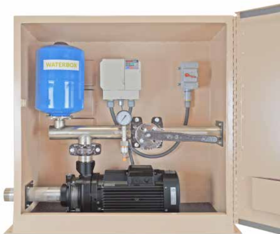
WaterBox Model B Pumping System

Why choose The WaterBox Model B Pumping System?